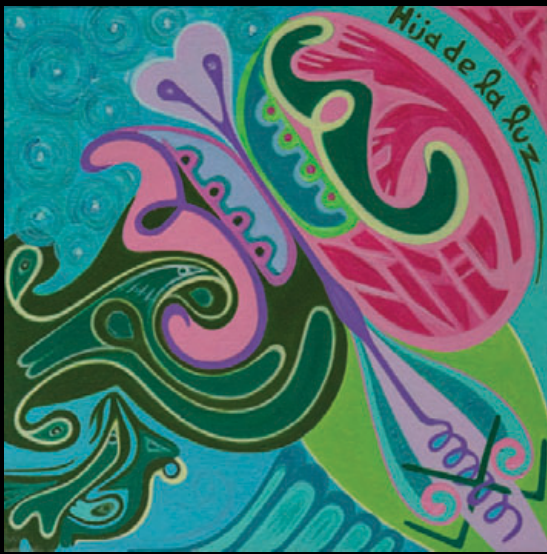
Syntonize joy 30X30cm