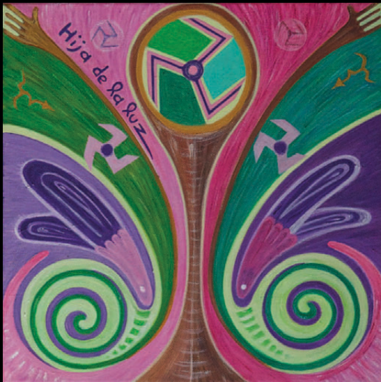
The essence of being 30X30cm