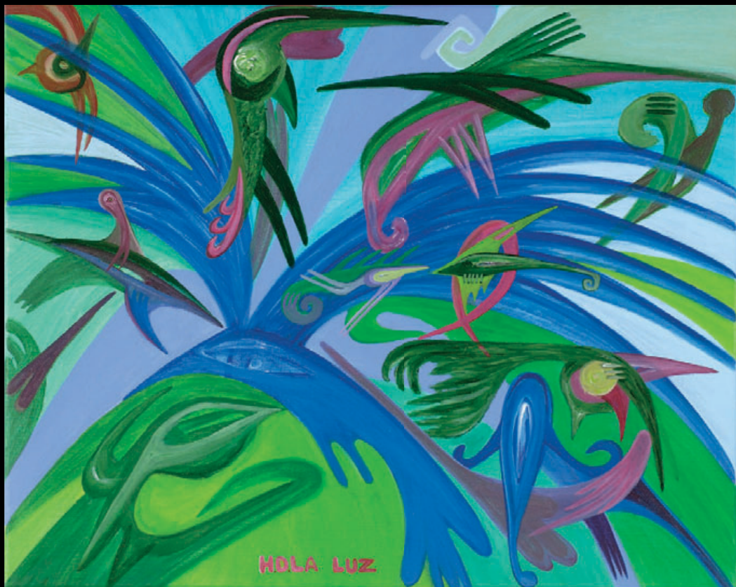
Eagle's vision 60X50cm

I sail on a clean windless sea . Maternity and loving feeling the silk touch of the water. I relax the body muscles and every cell of my existence and I become one with the peaceful watery nature of mine.