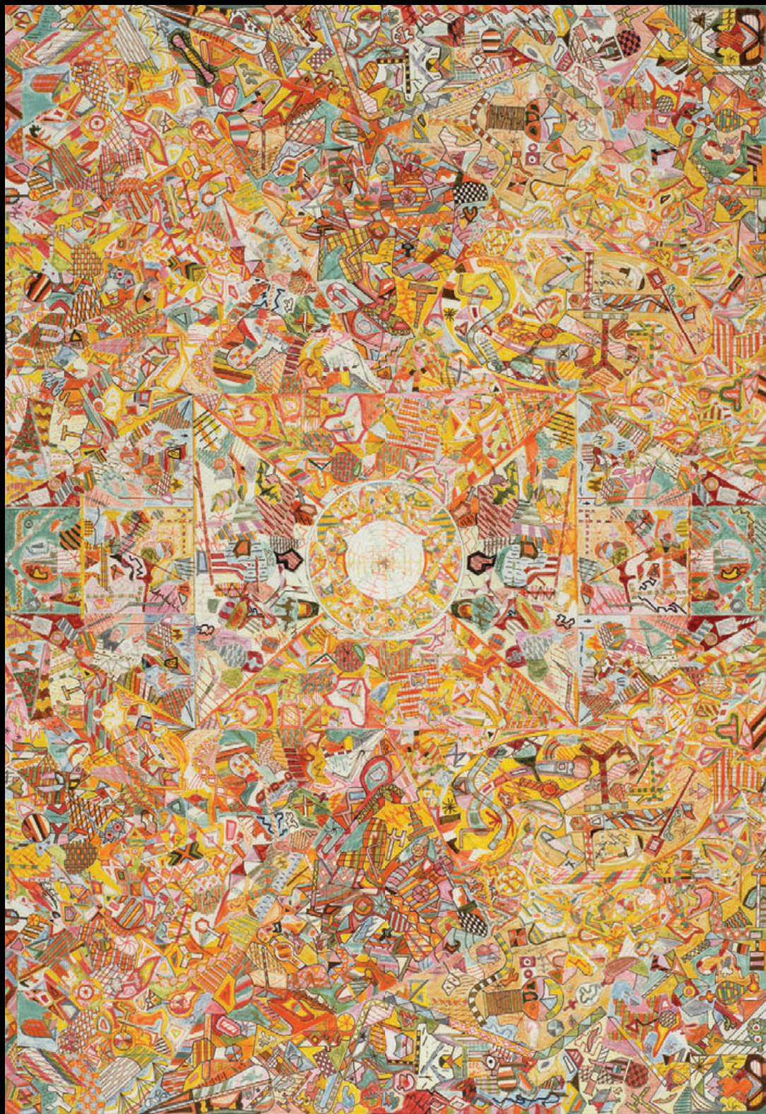
The book of life 100X120cm