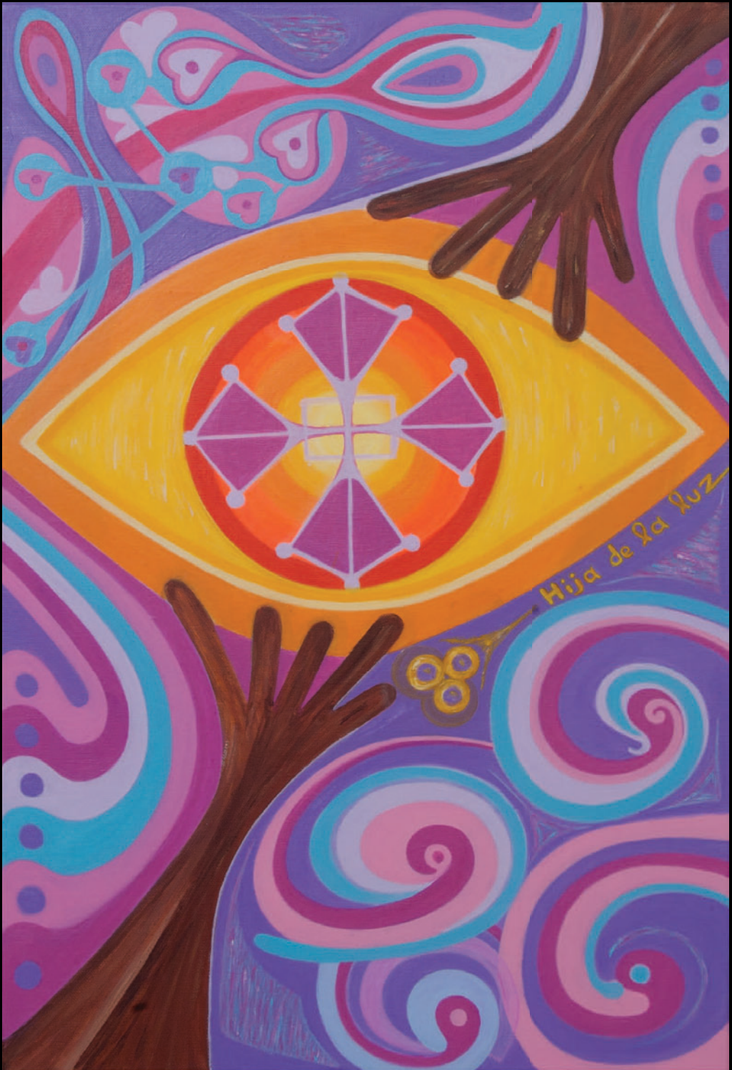
Harmonic relationships 70X90cm