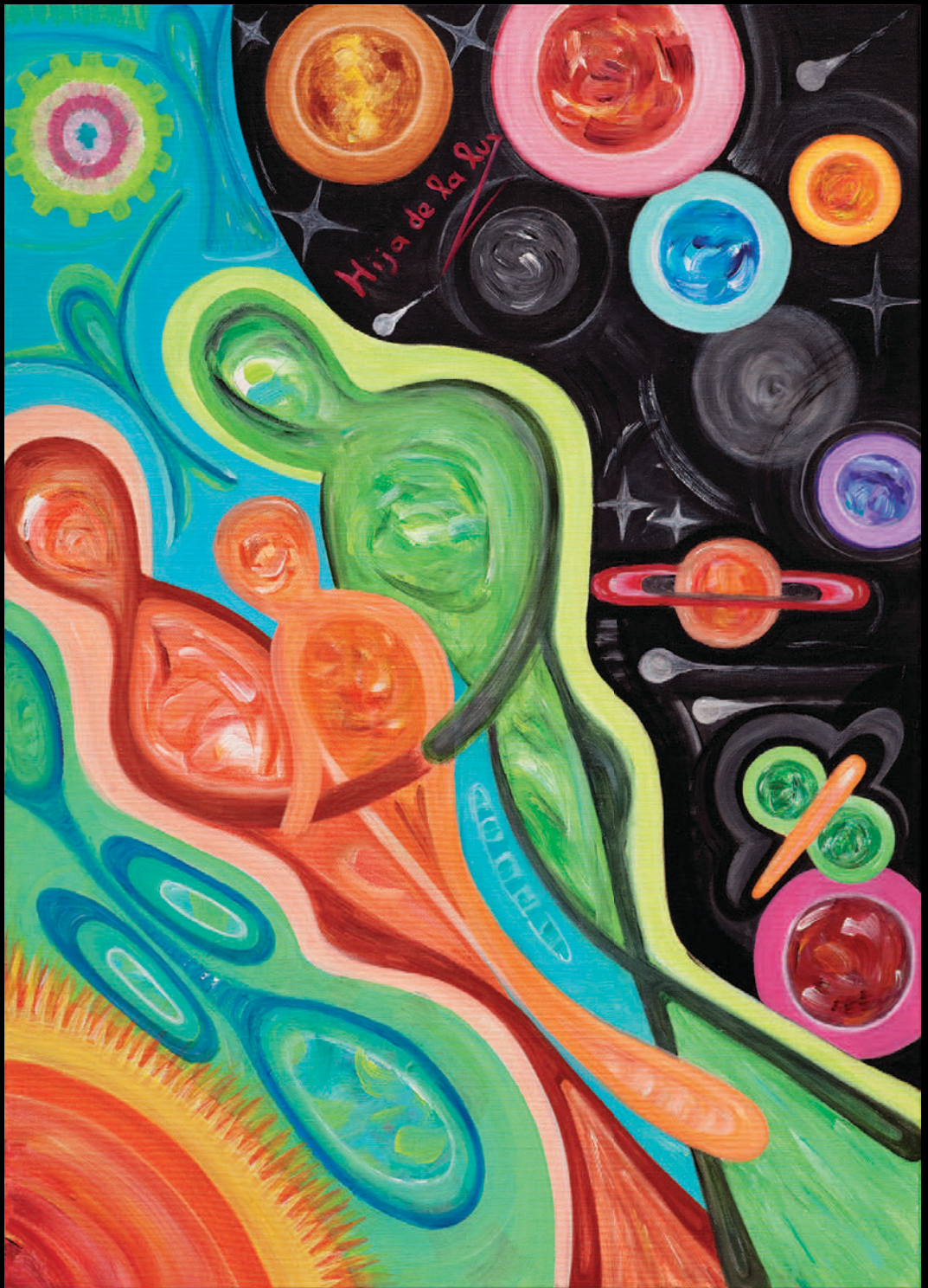
Cosmic family 70X90cm