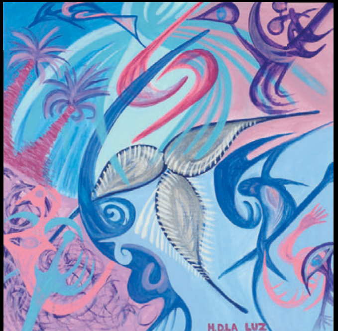
Sacred pure 40X40cm

In the space where life starts I touch the sacred. The miracle that grows inside me every moment in the centre of my heart and my existence.